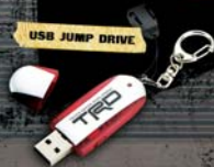
USB JUMP DRIVE